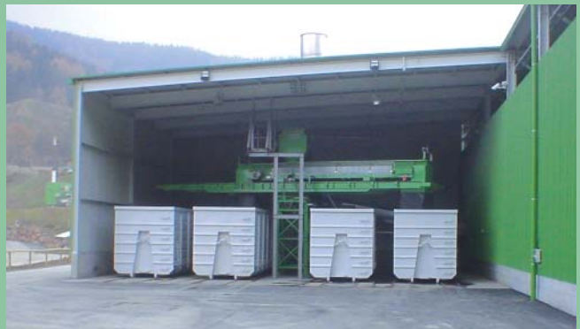
6. Loading into containers for transport to maturation