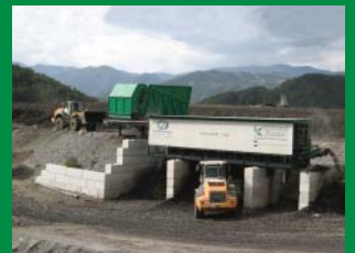
MBT-Output: maturation and screening