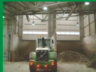
Topic MBT- New projects and experience