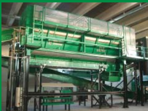
Modern technology for waste splitting