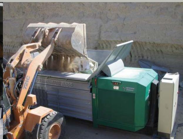
Stationary technology: External drive in a container or in the engine compartment KOMPTeCH FARWICK offers flexible solutions