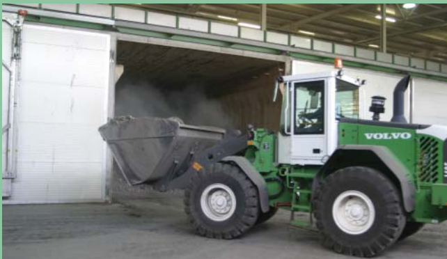
5. Emptying of the tunnel after 4 weeks