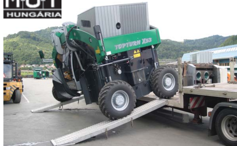
A TOPTURN X53 is on the way to Hungary.