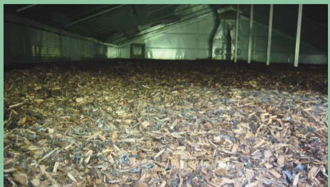
8. Treatment of exhausts- view into the biofilter