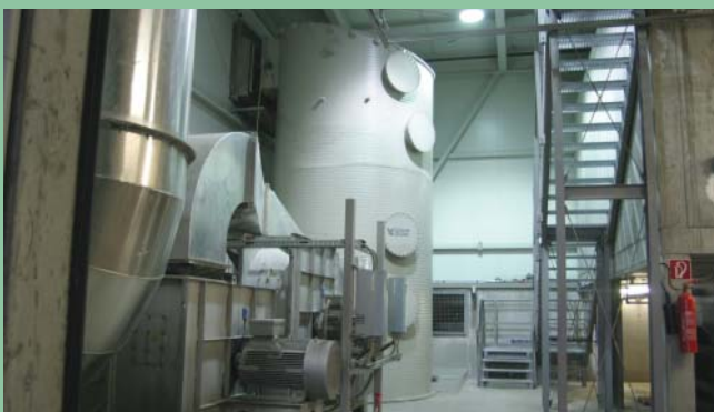
7. Treatment of exhausts- acid washer