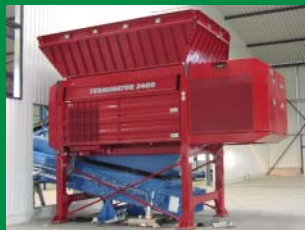
TERMINATOR- Stationary solutions