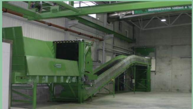
4. Decompaction unit for breaking up after 2 weeks of composting