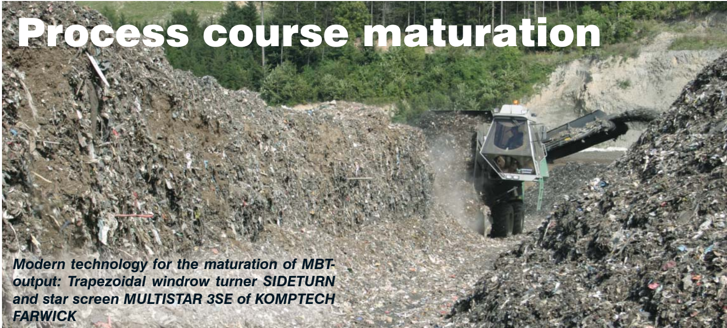
Modern technology for the maturation of MBT-output: Trapezoidal windrow turner SIDETURN and star screen MULTISTAR 3SE of KOMPTECH FARWICK

On the site of Frohnleiten first the delivered, mechanically pre-treated waste undergoes an intensive composting in closed tunnels. After the legally fixed composting time of 4 weeks the material leaves the closed plant and is then transported to the open maturation area on the landfill area. The required area was made trafficable also for very heavy machines, independent of weather conditions by a special stabilization procedure.