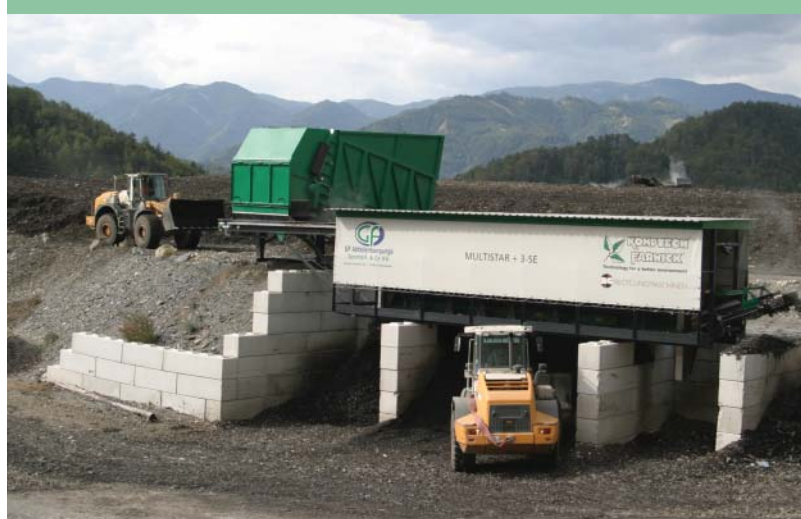
Star screen MULTISTAR 3SE for the compliance of the calorific value (according to the Austrian Landfill Regulation)