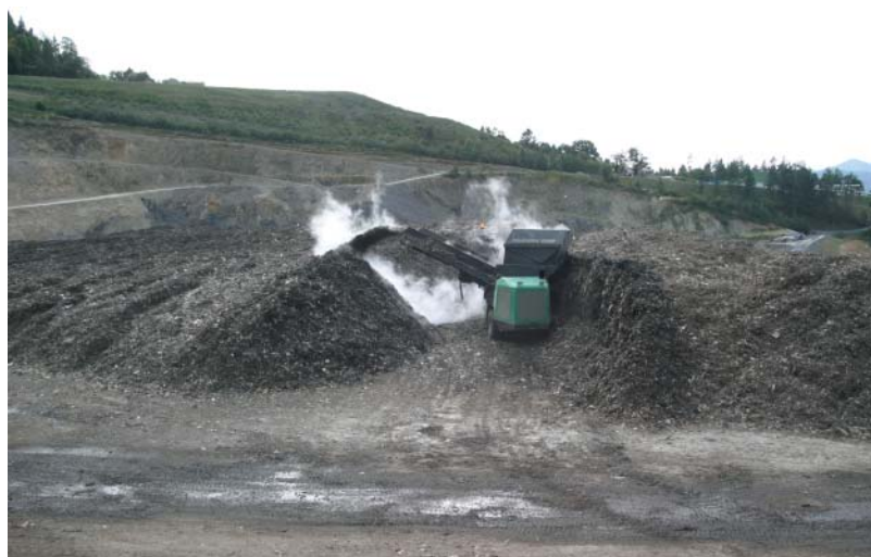
The throughput of the SIDETURN is between 1200 and 1500 m 3 /h (in this case)

At the end of the maturation time the material is screened through the 3- fraction star screen MULTISTAR 3SE. In one screening action 3 fractions are produced, whereas the screen section is selected via the regulation of the numbers of revolutions of the stars. So one can react flexibly on the output-material of the maturation and the requirements of the Austrian Regulation for Landfills can be executed exactly. Small grain and as a rule also the middle fraction, which can if necessary also be wind-sifted, remain under the calorific value of 6.000 kJ/kg DS (dry substance) and are stored. The gross fraction, between 5 -15 %, is incinerated. Also the further limits, demanded by the regulation, of the parameters respirations activity (AT4) and sum of gas contribution (GS21) remain surely under in the output maturation.