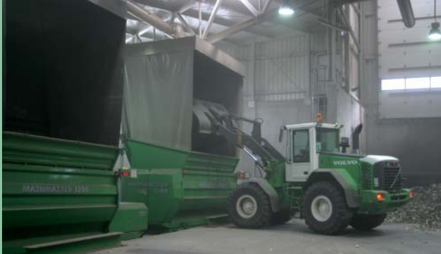
1. Feeding systems: MASHMASTER mixing units