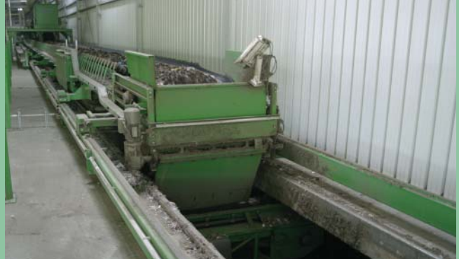
2. Automatically filling of the rotting tunnels